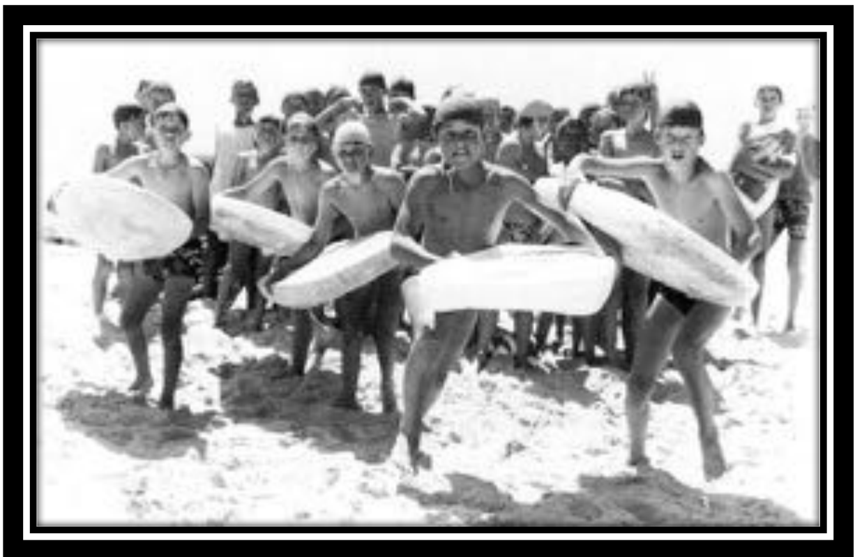
City Nippers – 1972!