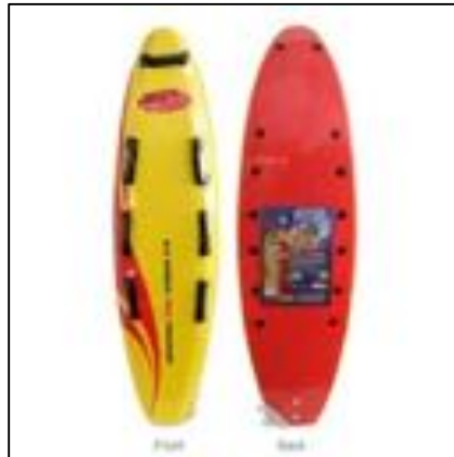
Example of a foam beginner/training nipper board.

Other beginner soft boards that help the younger nippers transitions to a Nipper Board or to help build a child's confidence in the surf may also be used at Nippers on a Sunday morning. Please note: these boards cannot be used at SLSWA sanctioned events.