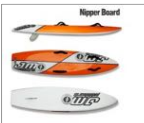
Example of a SLSA approved fiberglass nipper board.