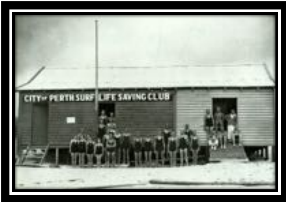
Clubrooms Circa 1930