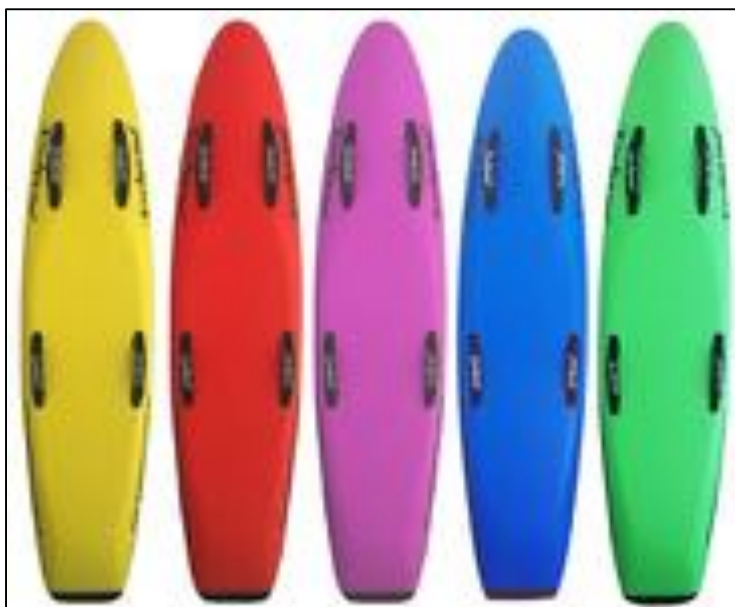
Example of a SLSA approved foam nipper board.